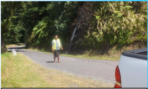
LTD Division at the Savaii inspection

As a result of these round islands RMIP undertaken, it was evident from the findings that there has been a significant change with road upgrading works in both Upolu and Savaii since the previous RMIP carried out in mid-2014. This stems from the fact that majority of the roads were upgraded along with other appropriate road furniture to ensure road safety and enhance road infrastructure durability. However, there were also significant issues observed by the inspection team pertaining to road construction works whereby other contractors did not fully comply with LTA Road Construction standards resulting in road surface resealing and other road related