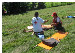
Red Cross assessing wounds to passengers before transporting them to Triange Area

The certificates were endorsed by the Minister on the 19 May 2015 and valid for five (5) years.