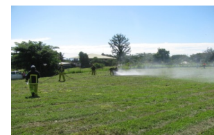
FESA bringing the aircraft fire under control