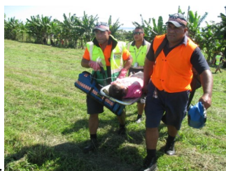
Rescued Effort by FESA and Police

After consultations with the CEO the final Exercise Critique Report which included recommendations for improvement was forwarded on the 18