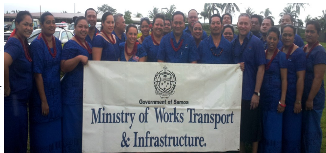
MWTI Staff and Management after the 53rd Independence parade at Mulinuu

“Vision— To be proactive in maintaining its national and international standards as the regional leader in pursuing safety and security of all forms of Transport and Infrastructure.”