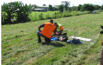
FESA and Police collaborating to rescue injured passenger

The annual audit for both certificates was conducted in December 2015 and found the certificate holder compliant with the rule requirements. Subsequently, the certificate holder had forwarded the required